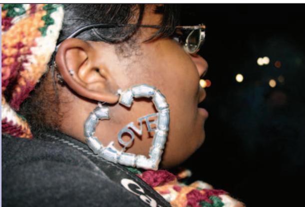
This photo by Daimon Lee-Boyd, a junior at Central High School, took first place in a competition among youths participating in our Excel photography program. His photo and two runners-up photos are displayed in the Family Learning Center. Photos from all 13 high school participants were unveiled recently in a special exhibit at the Museum of Contemporary Art (MOCAD) in Detroit.